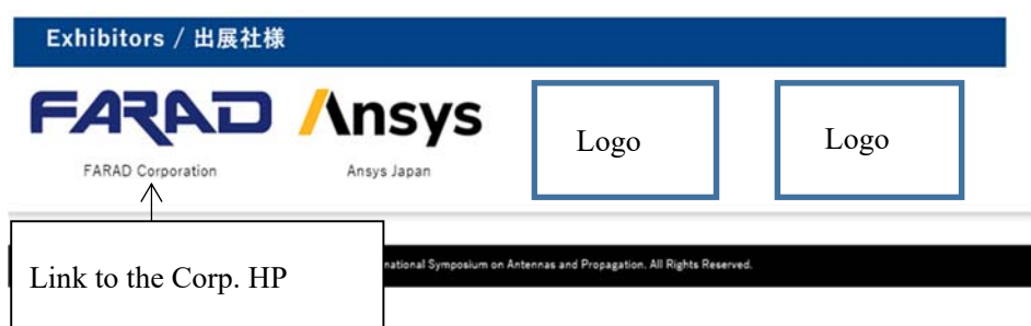
Fig.1 Image of Exhibition page