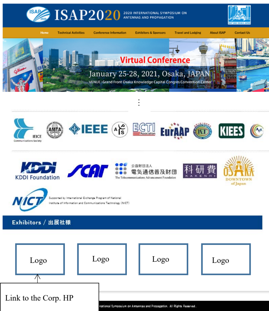
Fig.2 Image of the top page of ISAP2020